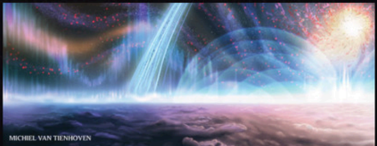
MICHEL VAN TIENHOVEN

MICHEL VAN TIENHOVEN: This art is some of the earlier concept pieces for the game and they represent the initial ideas we had of the planet's look and feel in general. We envisioned this alien planet to be relatively small with lower gravity than we have on Earth and creatures that are unknown to mankind. We used many sources of inspiration including ancient civilizations, underwater worlds and sea creatures.